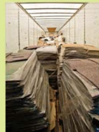
InterfaceFLOR Closed Loop Reclamation & Recycling Process